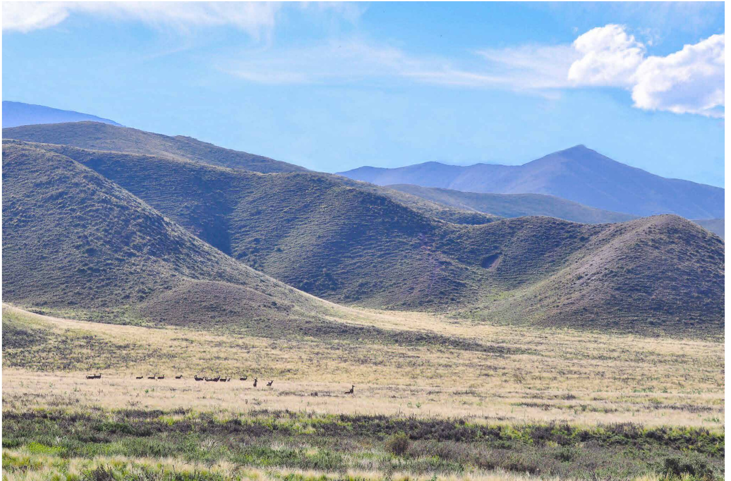
The surrounding landscape includes lush green valleys irrigated by small creeks, set against a backdrop of high peaks. It is these rich pastures that concentrate the game.