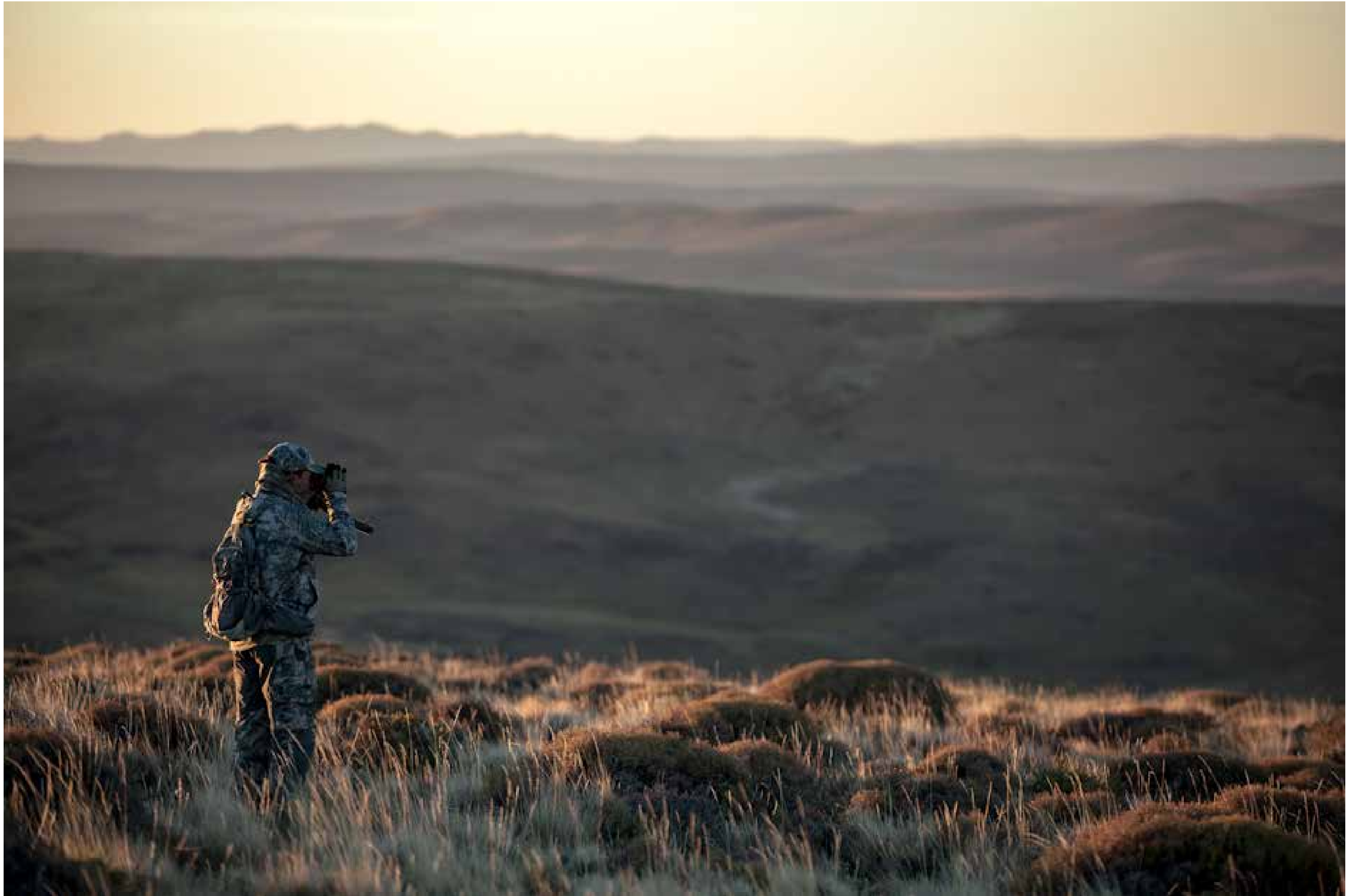
100,000 acres of endless habitat for wild game.