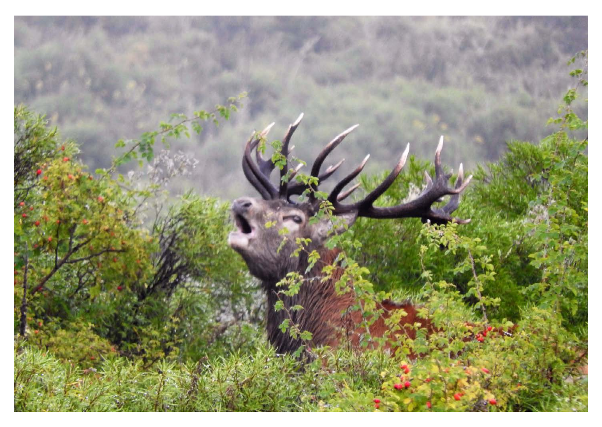
The fertile valleys of the Mendoza Andean foothills provide perfect habitat for red deer, were they develope impressive racks, with some specimens naturally reaching the 450 SCI + class .