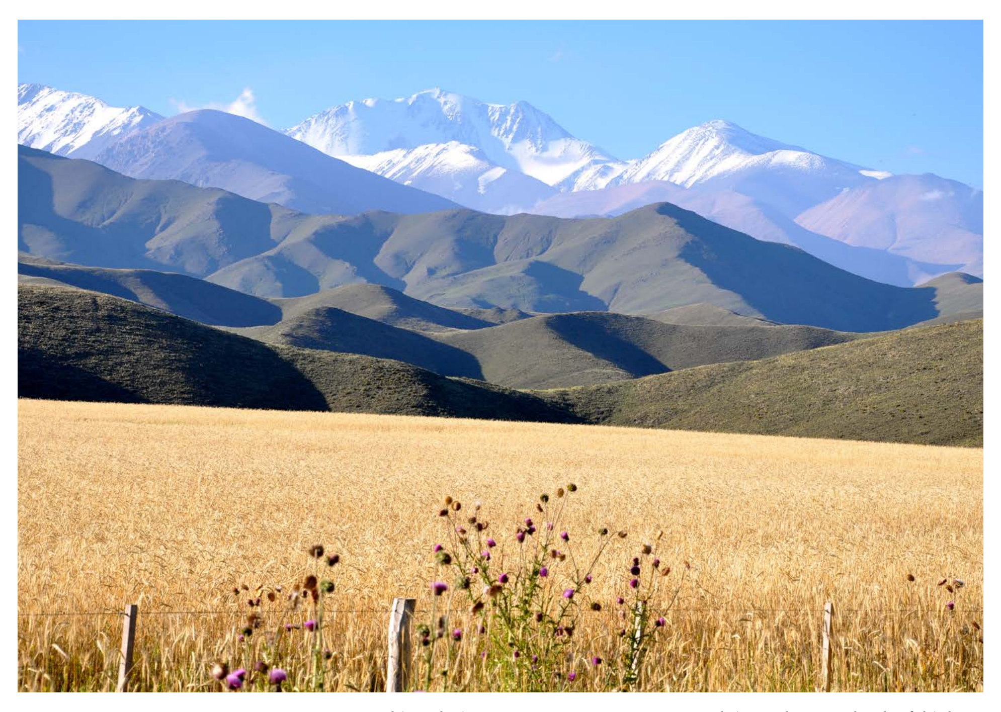
This exclusive preserve spans 25,000 acres and sits on the upper levels of this huge ranch. A couple of 20 + thousand feet peaks are within the ranch west boundry.