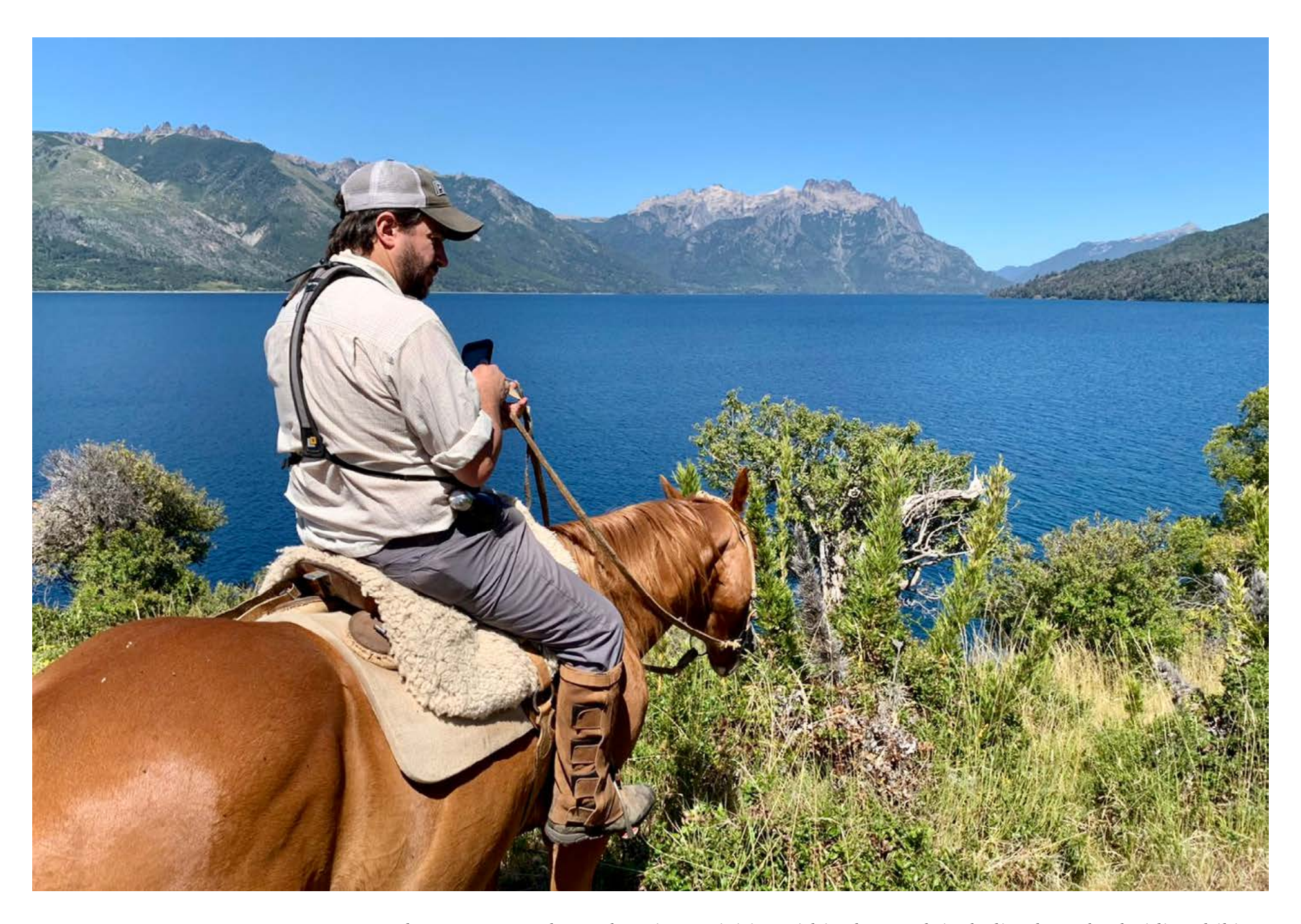
There are several non-hunting activities within the ranch including horseback riding, hiking, birdwatching and trout fishing on the lake.