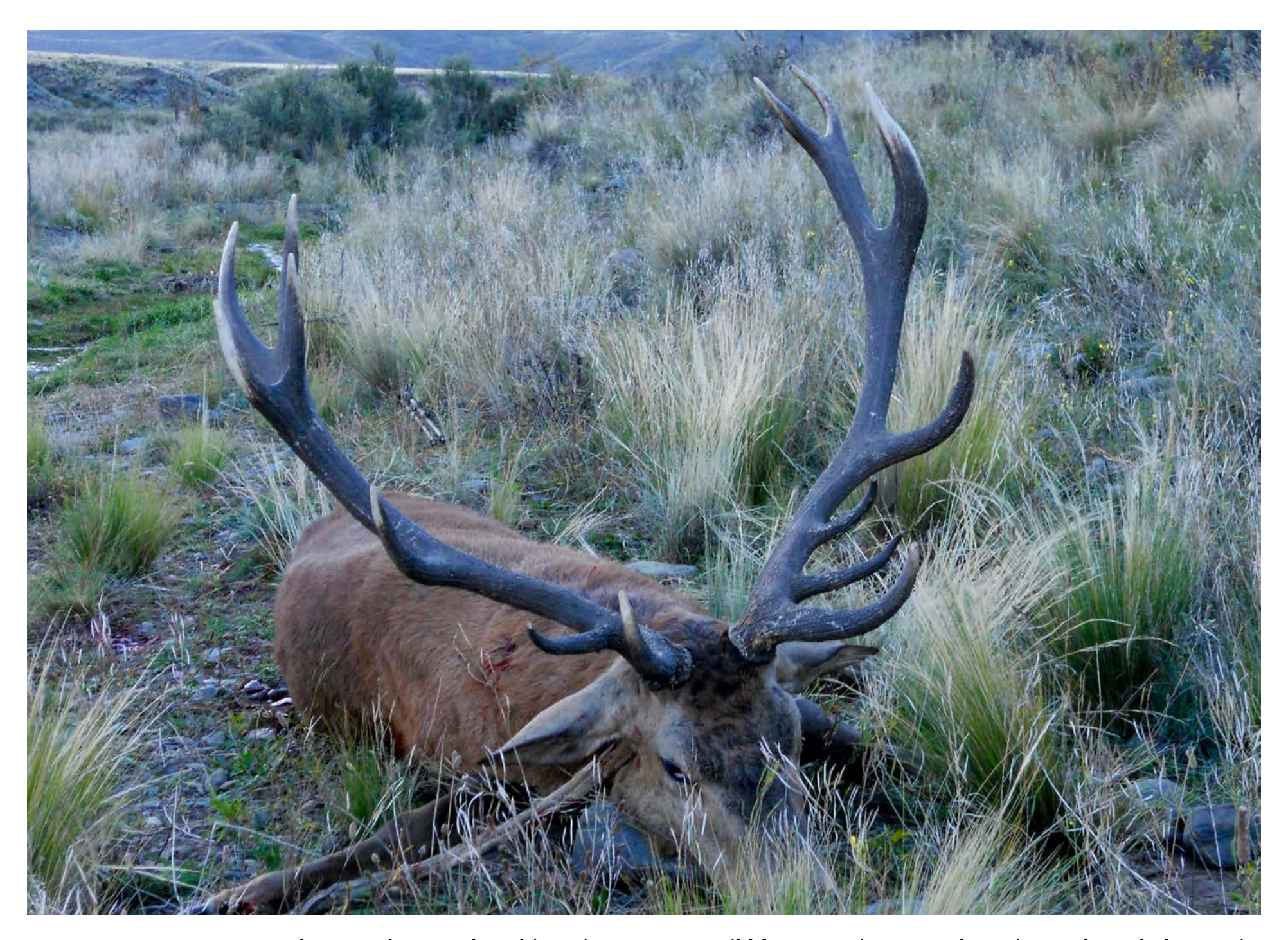
The stags that populate this region are 100% wild free-roaming game that migrate through the terrain.