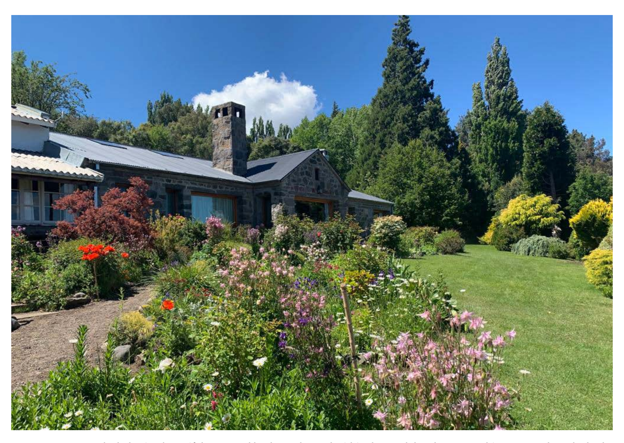
The lodge is a beautiful stone and log house located within the ranch headquarters. This compound overlooks the expansive Huechulafquen lake providing some of the most amazing views one can find.