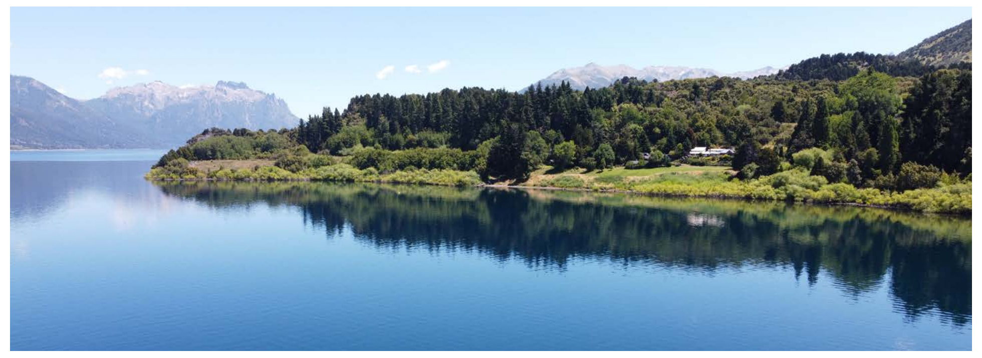
This area in northwest Patagonia offers a breathtaking mountain landscape interspersed with lakes and streams, all within the views of our living room windows.