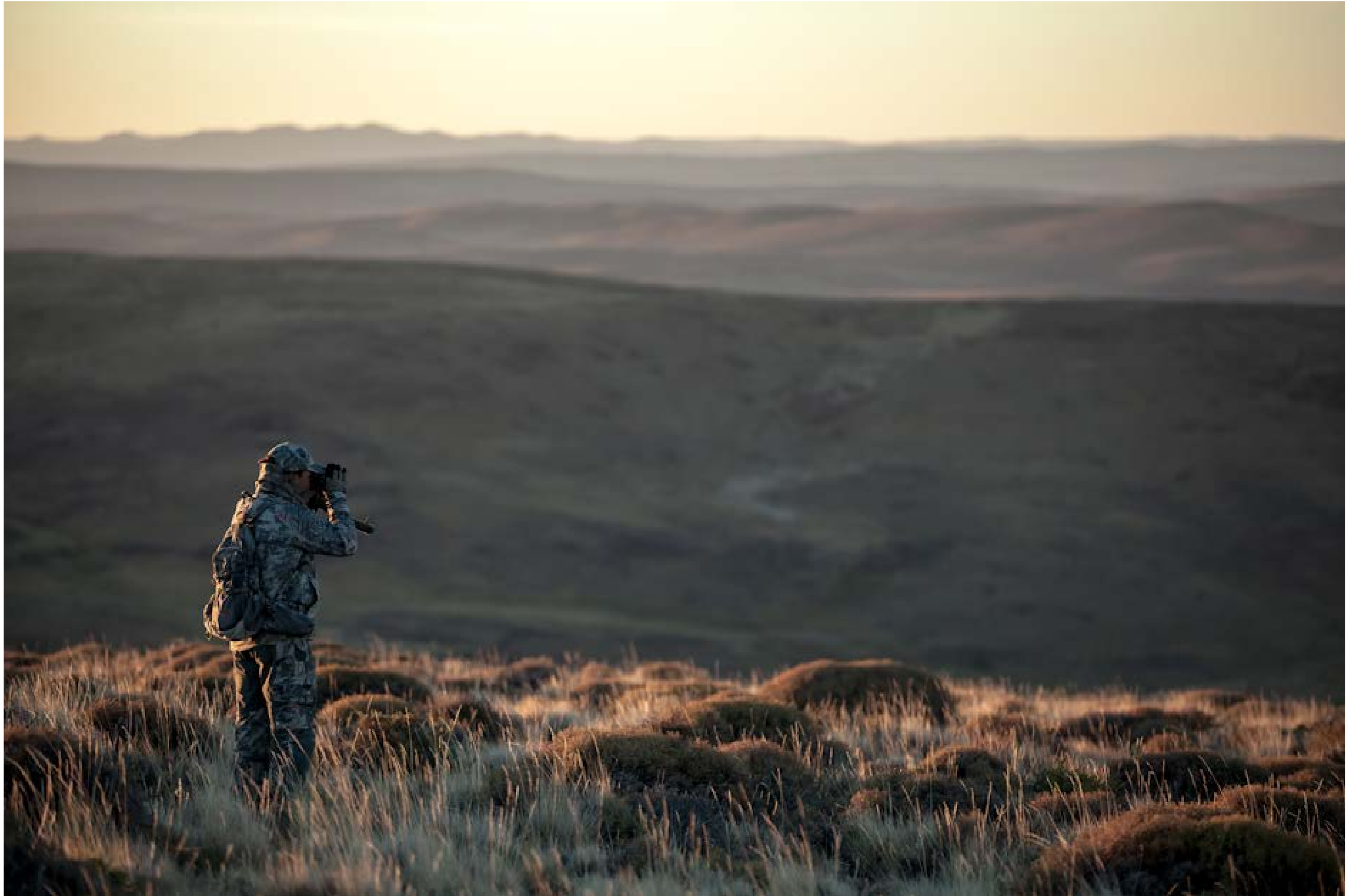
100,000 acres of endless habitat for wild game.