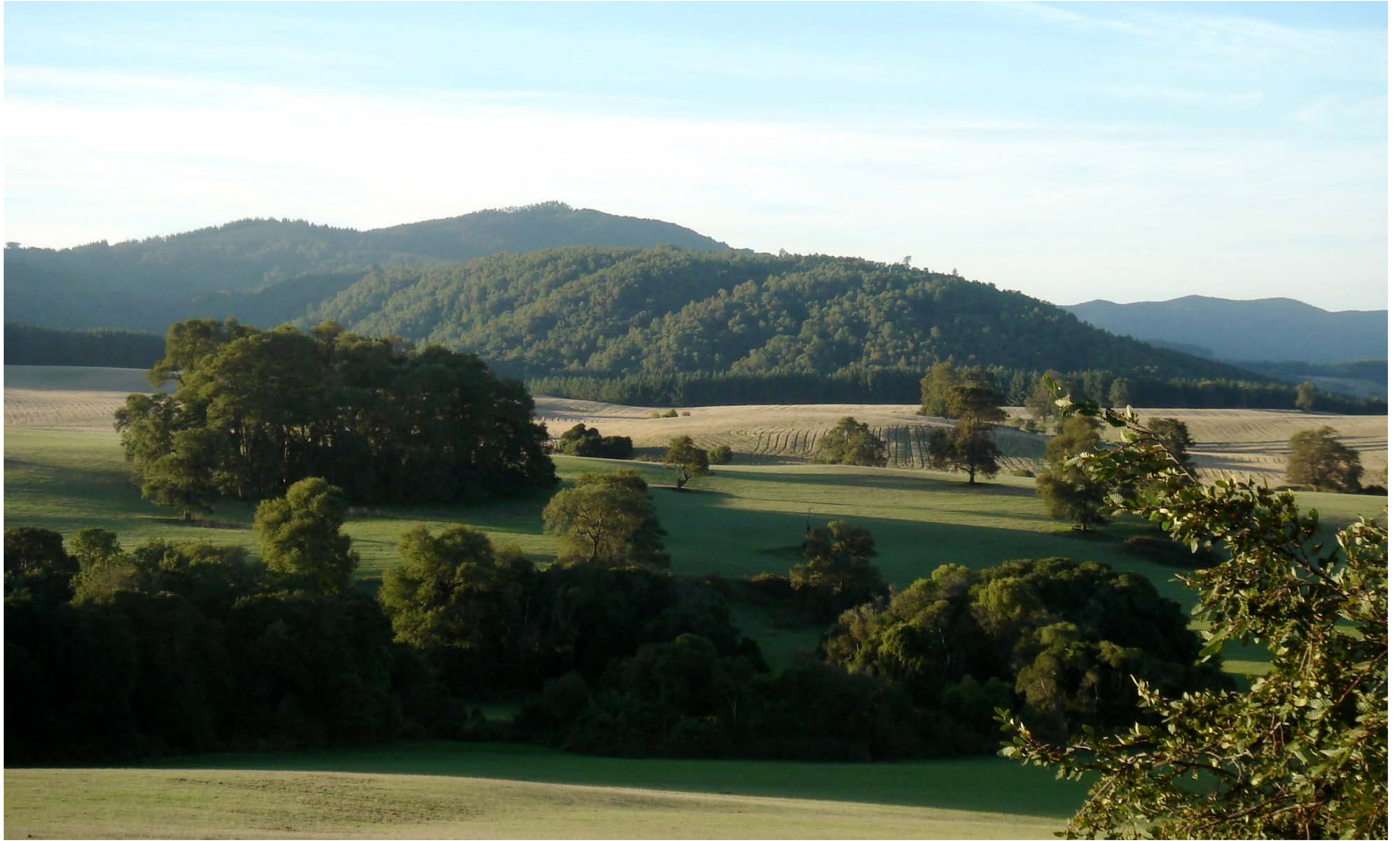
Our Fundo (like chileans call ranches) is a mix of native thick patagonian forest and open medows of grassland and crop land.