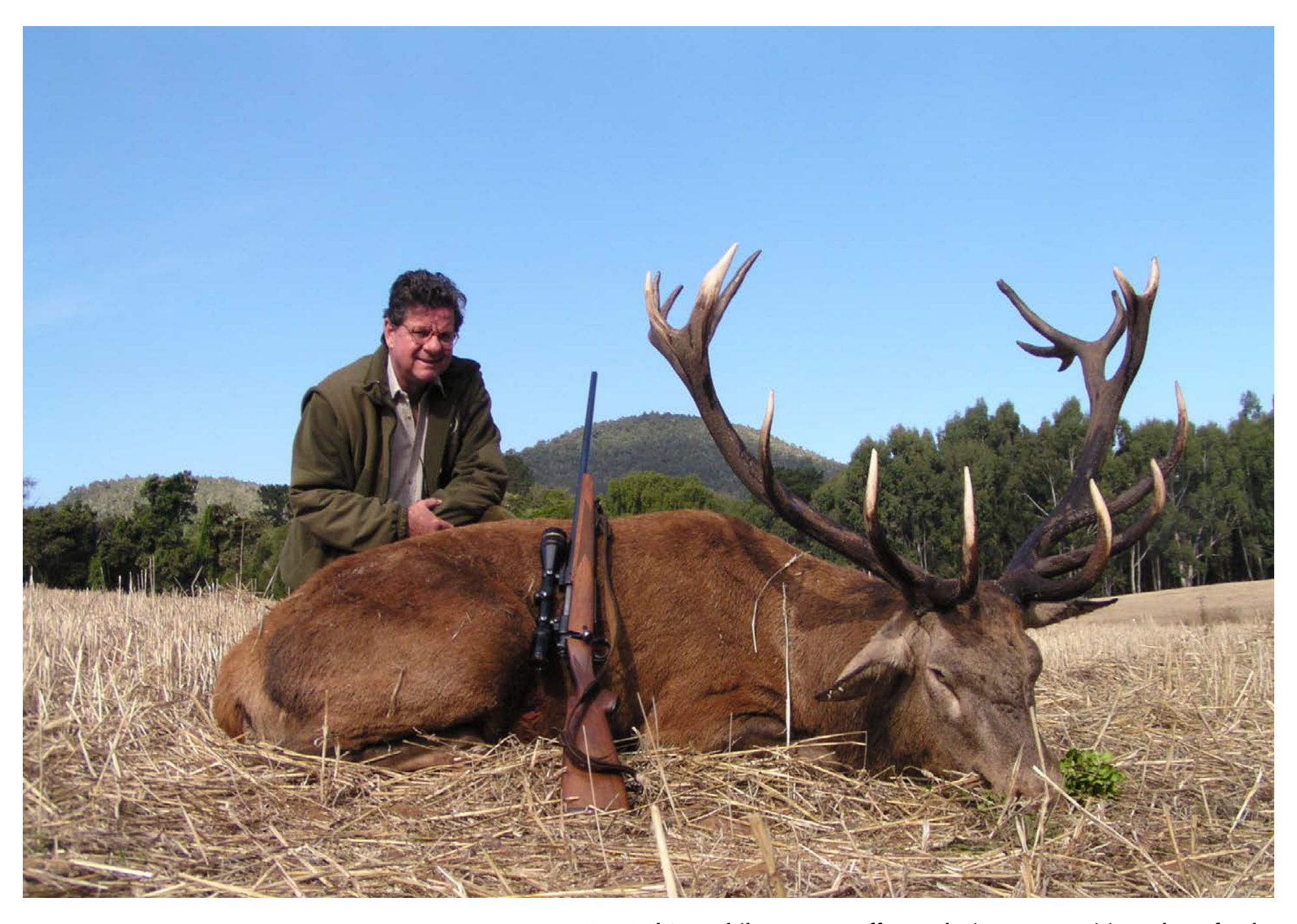
Our Red Stag Chile program offers exclusive opportunities to hunt for the enormous Red Stags that roam the Central Valley of Chile.