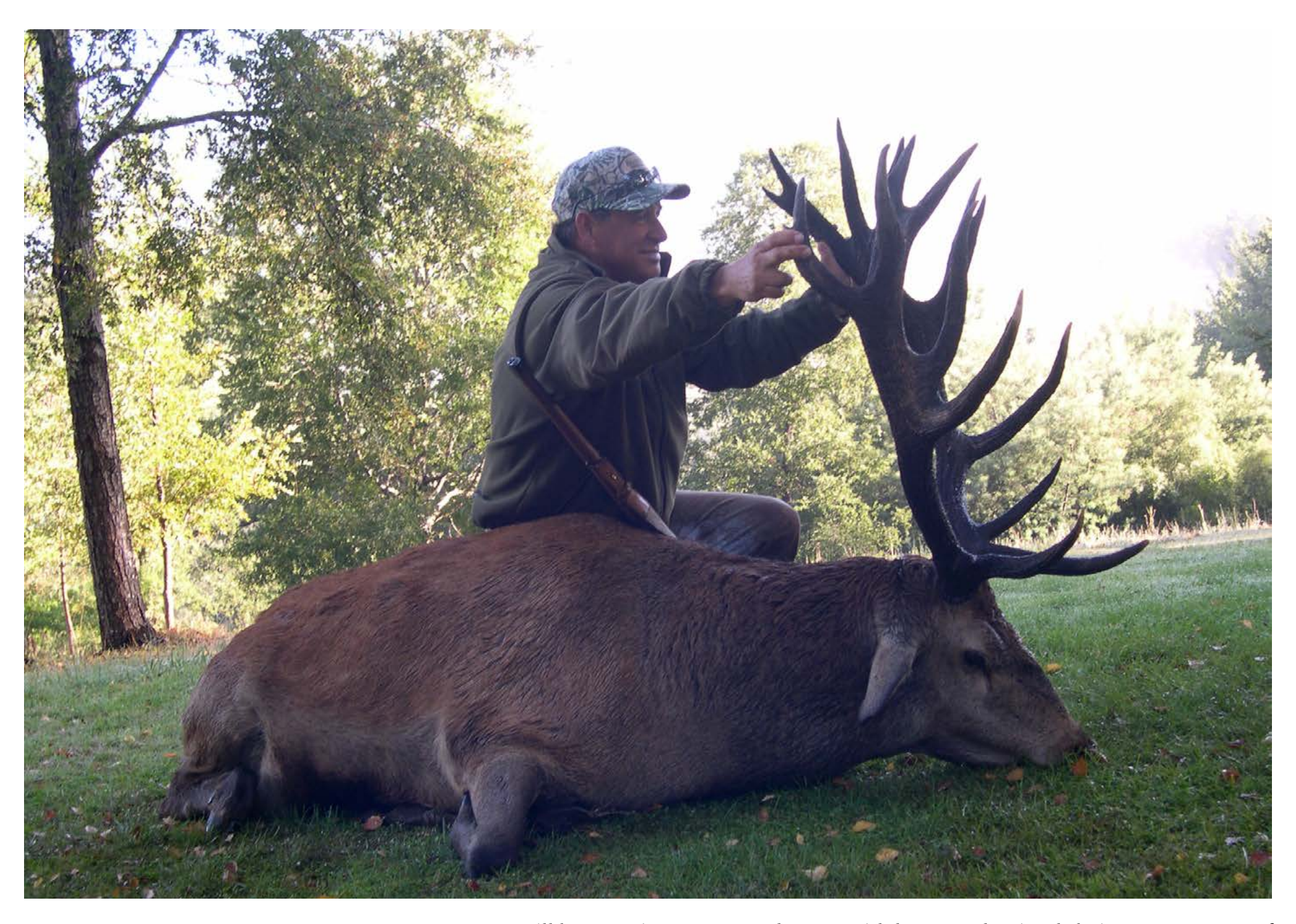
You will be pursuing mature red stags, with harvested animals being over 9 years of age along with massive body size and antlers to match.