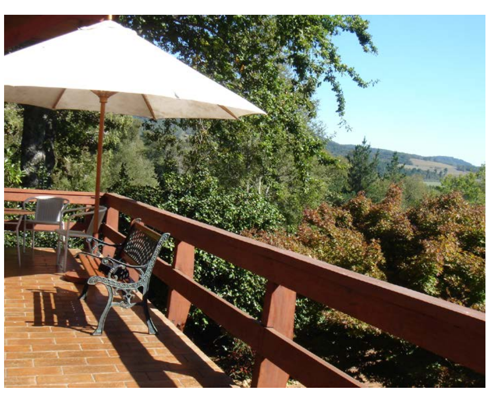
Balcony with stunning views of the landscape.