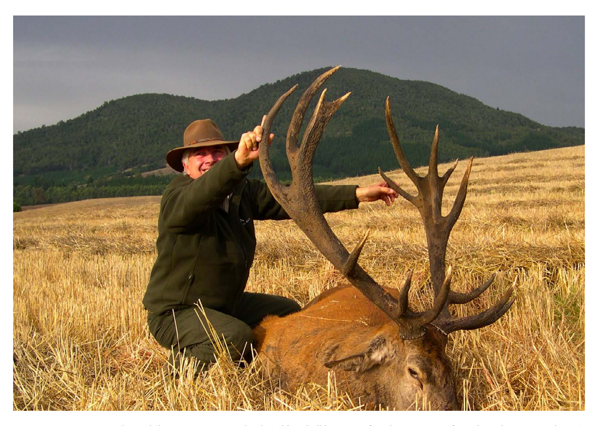
These Chilean stags are completely wild and all hunts are fair chase on an unfenced ranch. No more than six mature stags are harvested annually, so the opportunity to hunt these stags are in high demand.