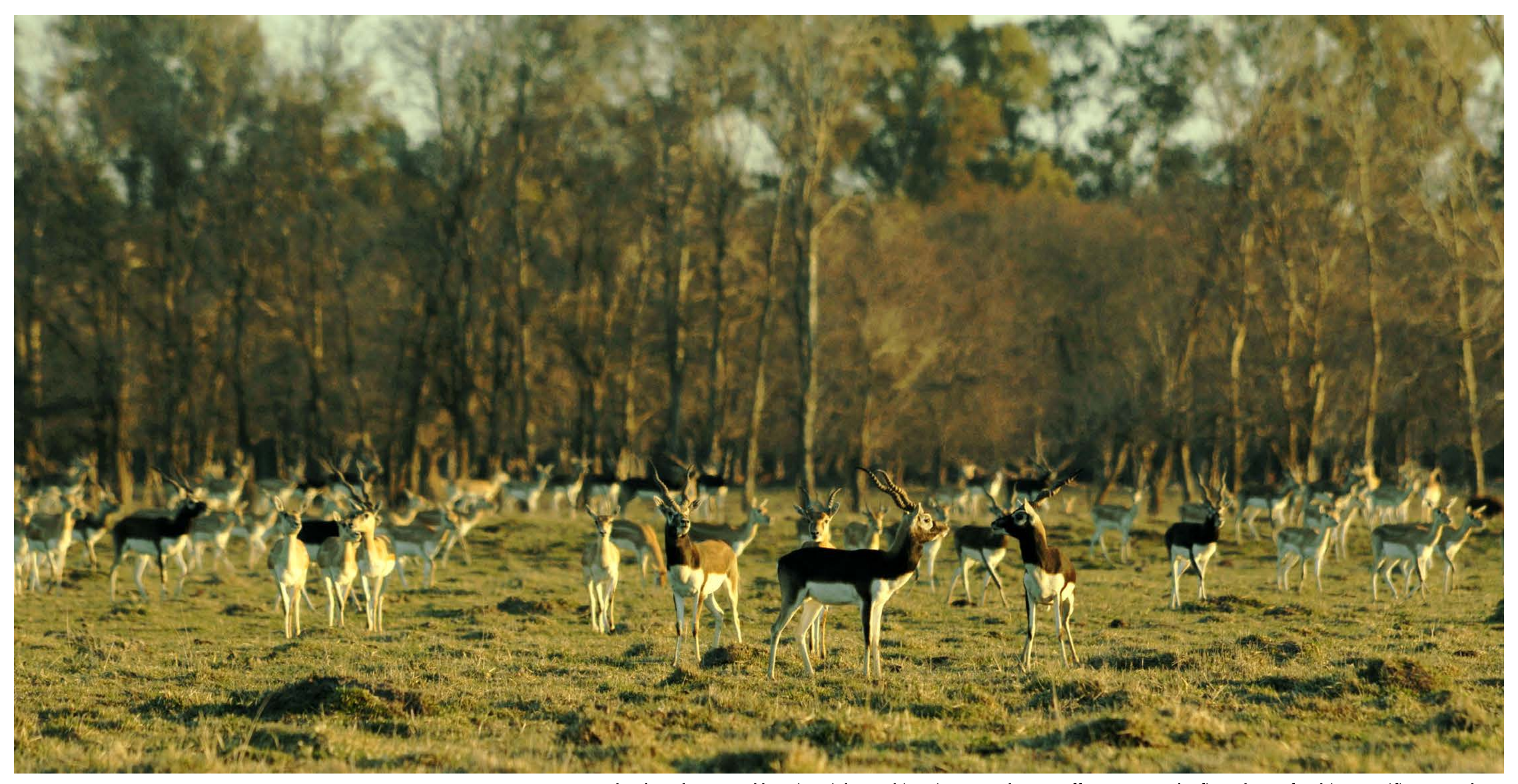
Thanks to leases and hunting rights on big private ranches we offer our guest the finest hunts for this magnificent antelope.