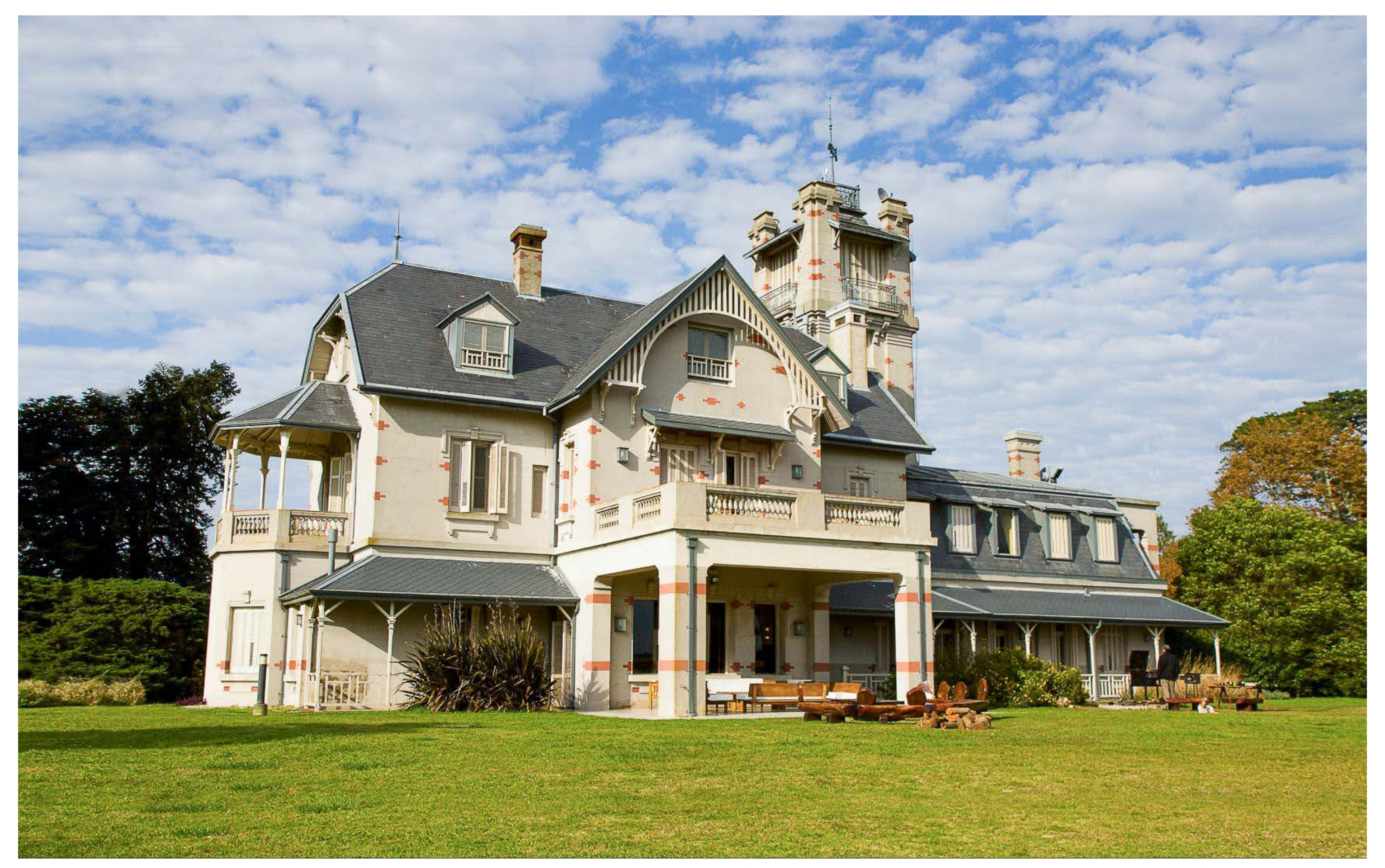
Out of Los Crestones lodge we have access to some the the biggest heards of Black Buck in the world.