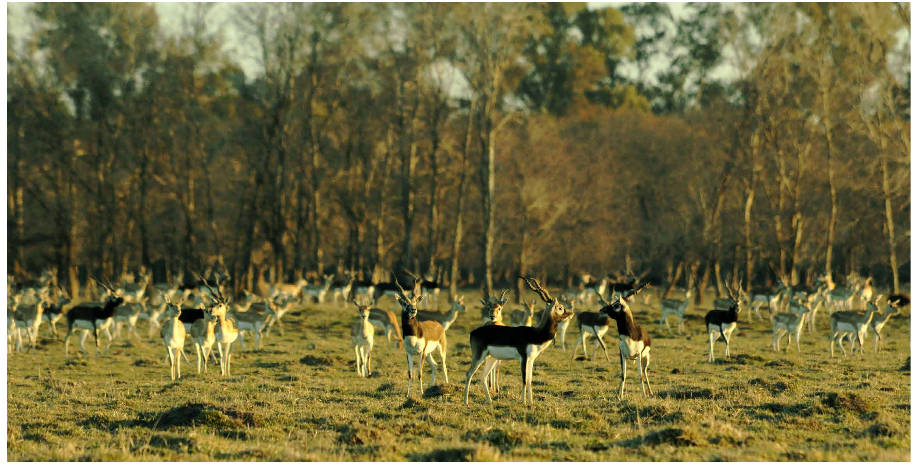
Thanks to leases and hunting rights on big private ranches we offer our guest the finest hunts for this magnificent antelope.