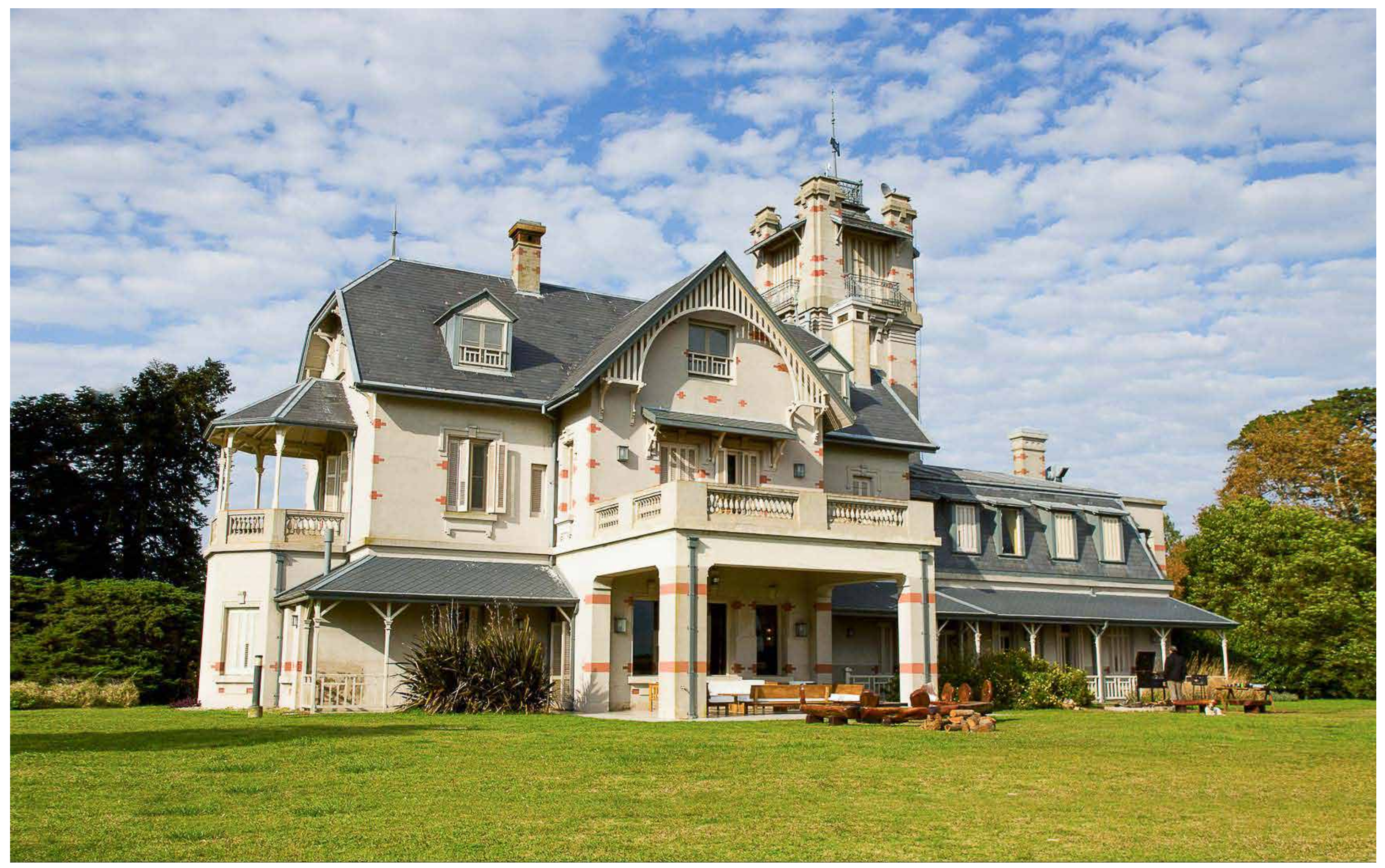
Out of Los Crestones lodge we have access to some the the biggest heards of Black Buck in the world.