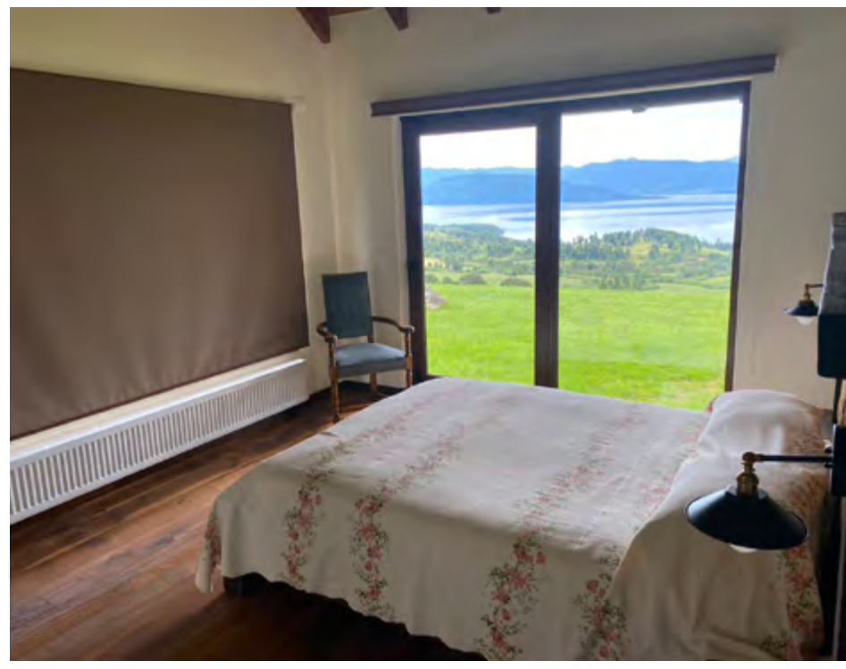
The lodge has 3 en suite rooms with Queen beds.