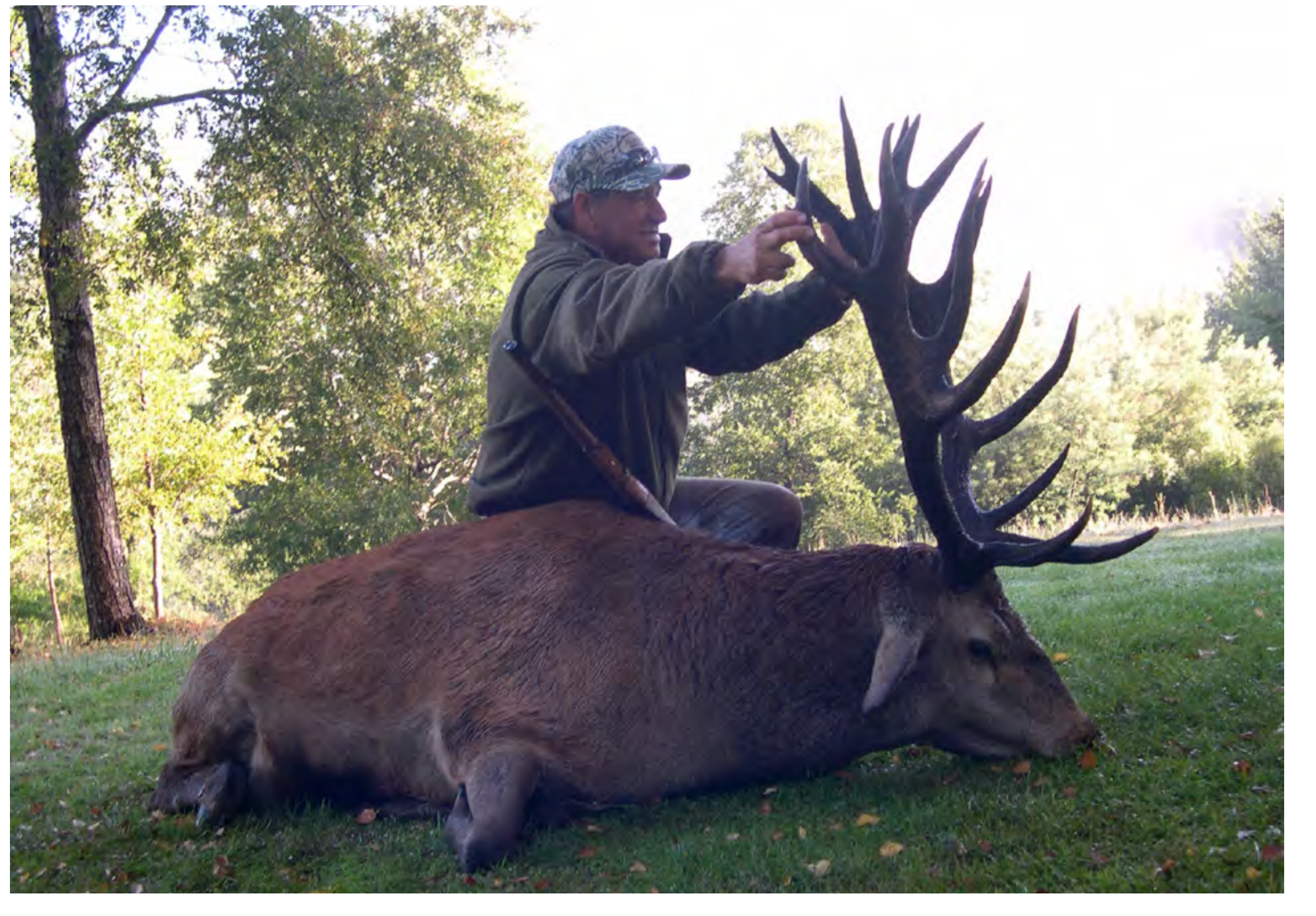
You will be pursuing mature red stags, with harvested animals being over 9 years of age along with massive body size and antlers to match.

To get to the lodge you need to fly into Santiago de Chile (SCL), which is served with daily direct flights from many U.S. or European cities. Once there, you'll take a 1.30 hour flight to Osorno Airport (ZOS). Hunters will then be picked up at the airport by the lodge staff, and transferred to the lodge along roads with stunning views of the Andes Mountains to the west. The drive to the lodge is 1.30 hour approximately. Helicopter transfers can also be arranged between the airport and the ranch, which take about 20 minutes.