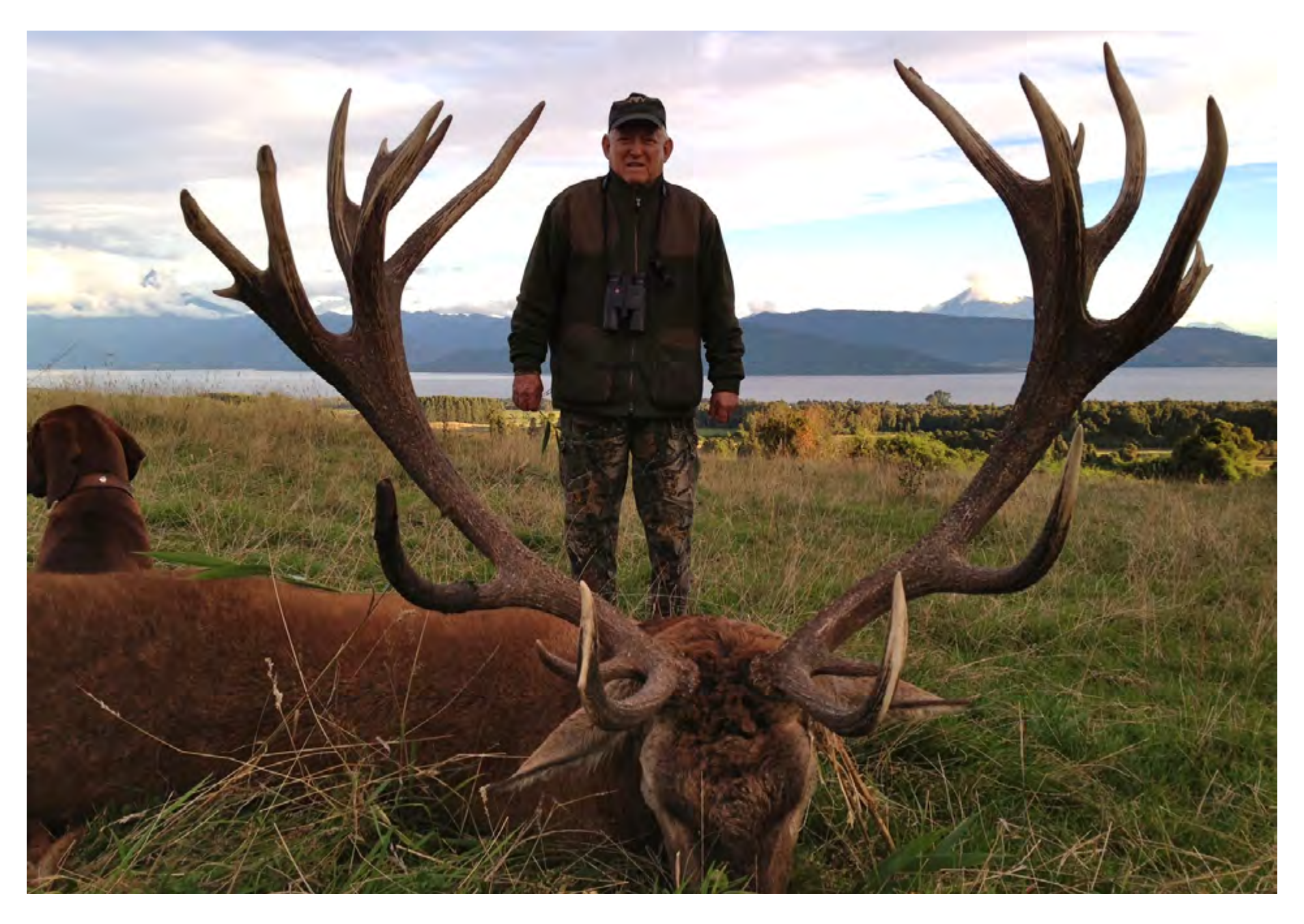
These Chilean stags are completely wild and all hunts are fair chase on an unfenced ranch. No more than eight mature stags are harvested annually, so the opportunity to hunt these stags are in high demand.