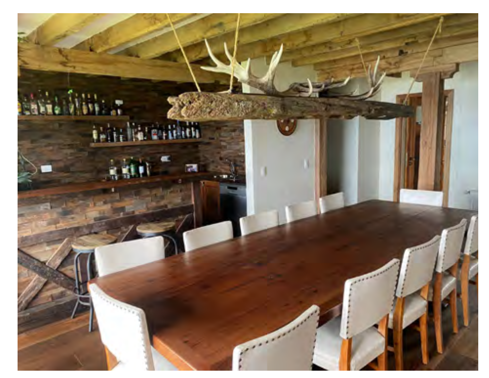
Cozy dining room where you'll be treated to a gourmet experience.

The lodge can accommodate up to 4 people at a time, with a maximum of 2 hunters and 2 non-hunters. For non-hunters, there are various activities available, such as horseback riding, hiking, fishing, sightseeing tours, and even helicopter flights. The lodge has a dedicated team of housekeeping staff, and laundry service is available.