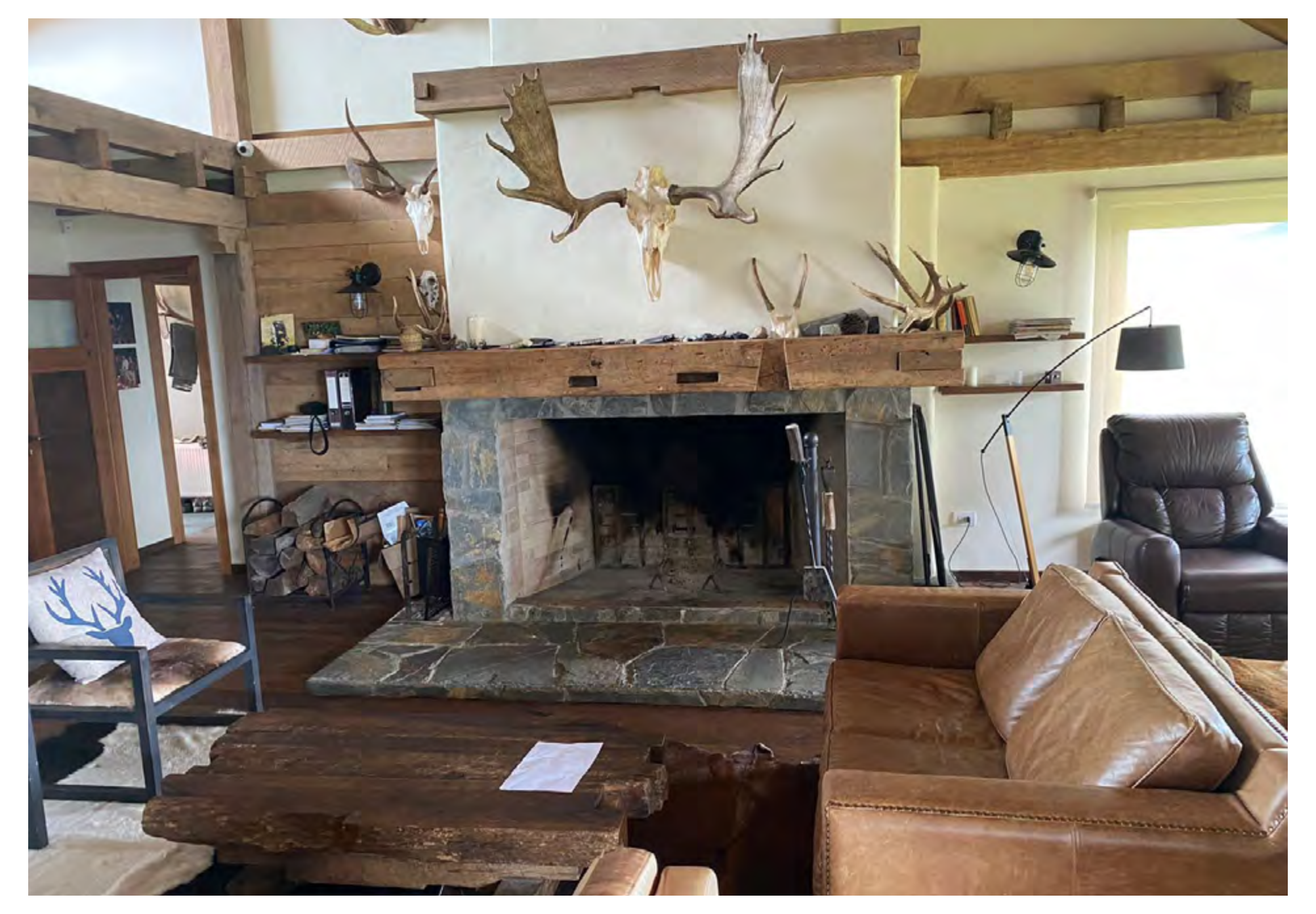
The 'Fundo,' as Chileans refer to their ranches, is built from local stone and wood, overlooking Rupanco Lake, adjacent volcanoes, and the main hunting grounds.