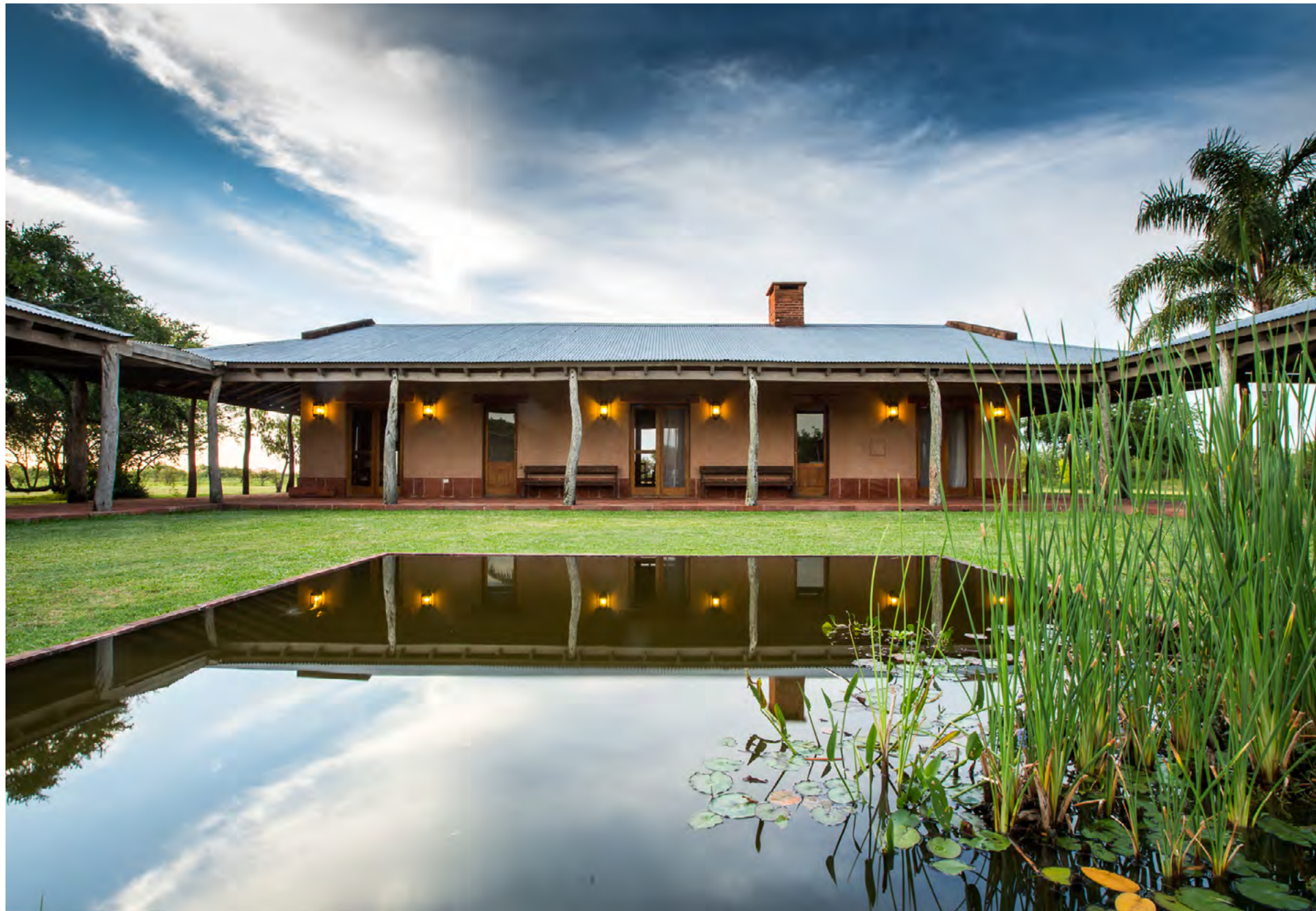
The Lodge was designed by award-winning architects to respect traditional regional elegance—offering all of the comforts and luxuries of a contemporary hotel.