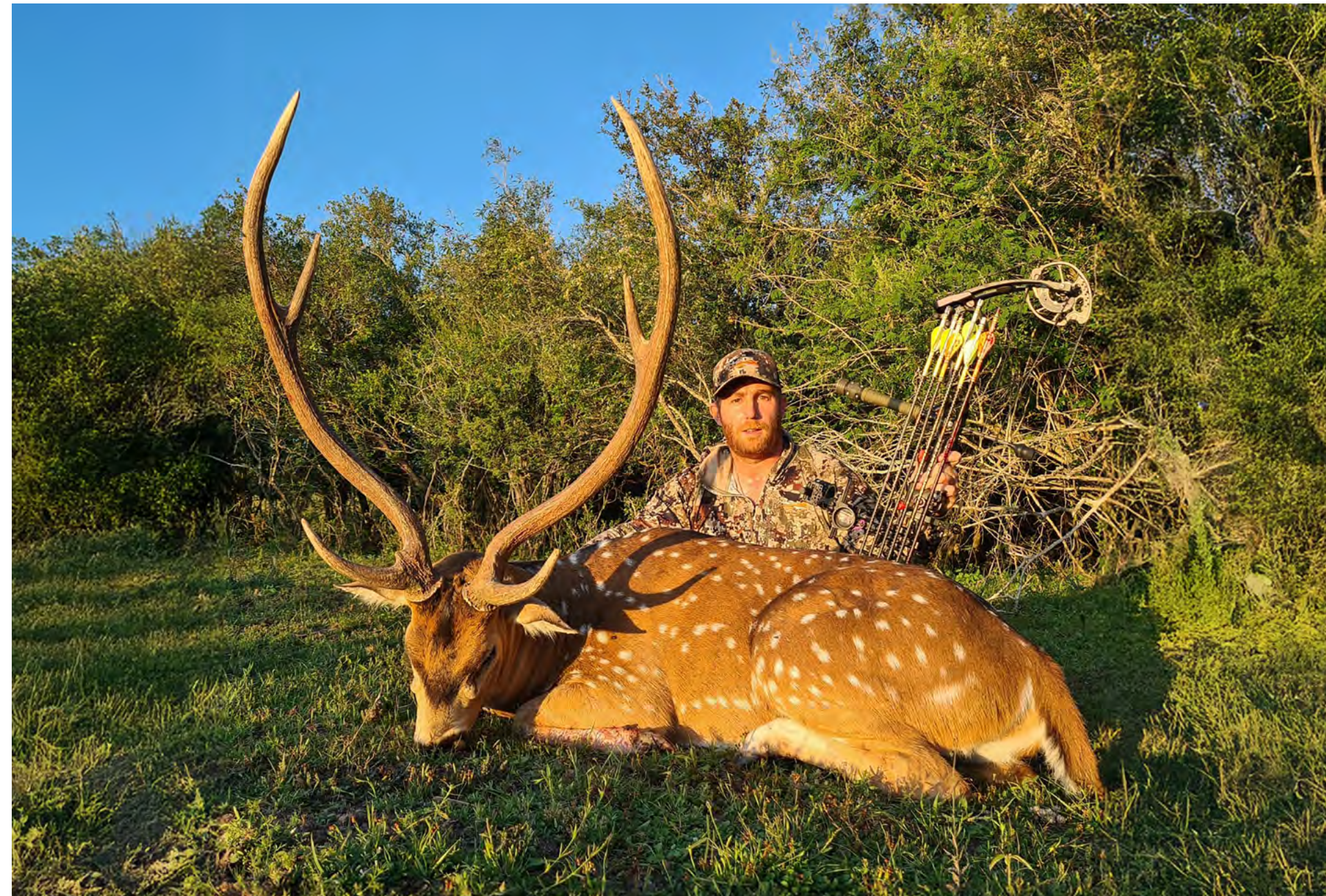
Free-range beauty in the Iberá Wetlands. This Axis Deer trophy from Corrientes Big Game is a true testament to the wild, untamed spirit of Argentina's grasslands