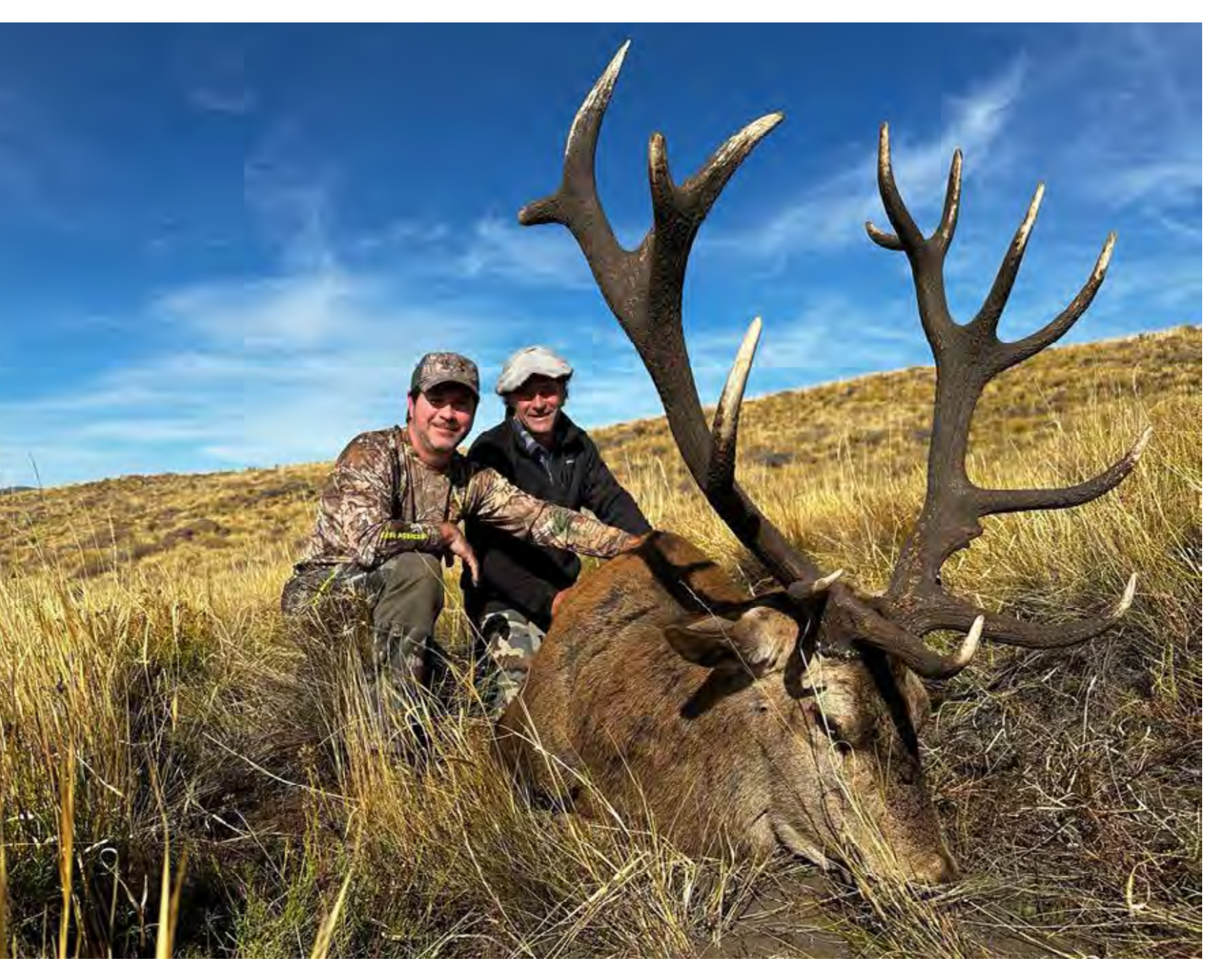
The stags that populate this region are 100% wild free-roaming game that migrate through the terrain.